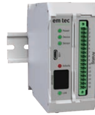
NEW SERIES: BioProTT™ FlowMCP-a